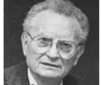
Paul A. Samuelson, Nobel Prize winner and former CREF trustee

For a list of previous Samuelson award winners, visit www.tiaainstitute.org/public/institute/awards/samuelson